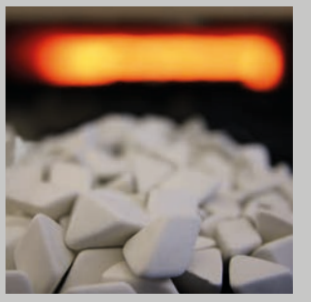
Our ceramic media production